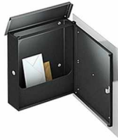
Anschlag rechts Schloss links