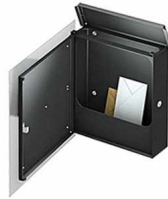
Anschlag links Schloss rechts