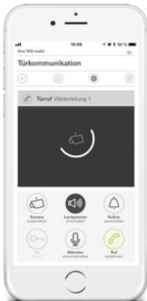
Bildaufbau ohne Rufannahme Türöffnung kann angenommen werden

incl. VAT plus shipping costs (exclusive of VAT for logged-in users with VAT ID and Non-EU countries)