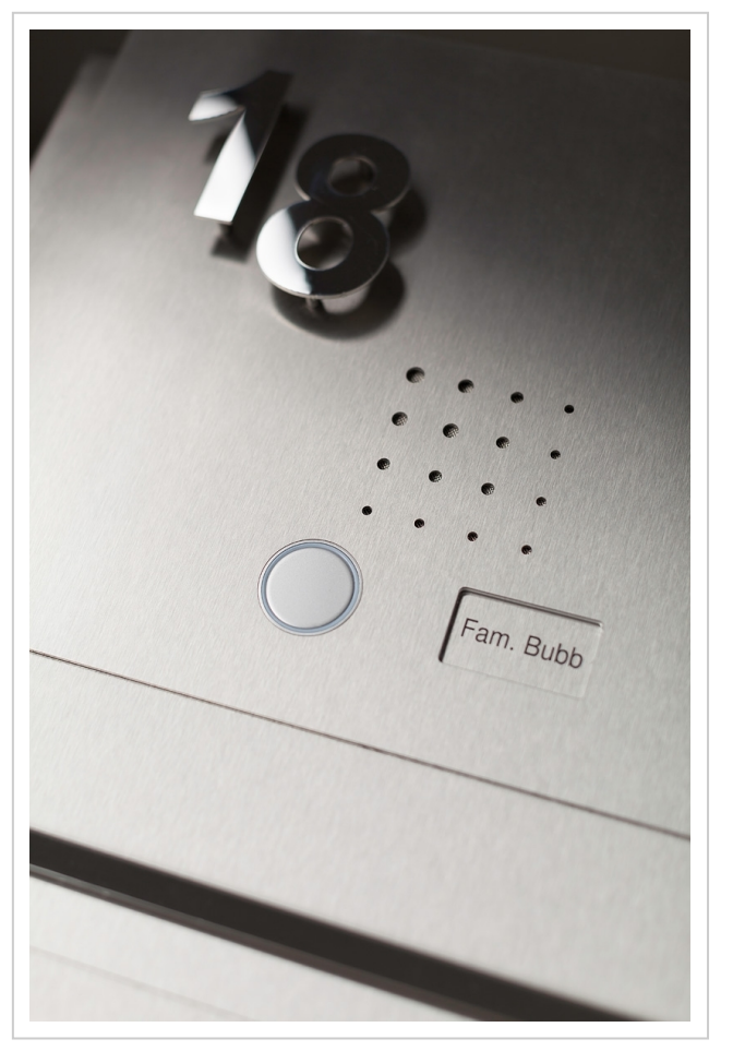
Briefkasten Manufaktur Lippe GmbH Werler Straße 60 32105 Bad Salzuflen