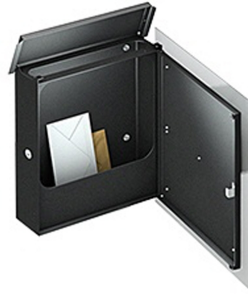
Anschlag rechts Schloss links