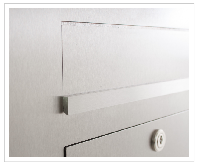
Briefkasten Manufaktur Lippe GmbH Werler Straße 60 32105 Bad Salzuflen