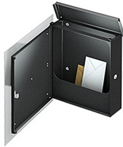
Anschlag links Schloss rechts