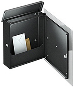
Anschlag rechts Schloss links