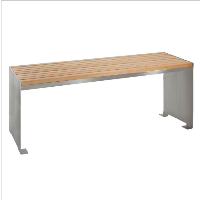
optionales Tablett (siehe Zubehör)