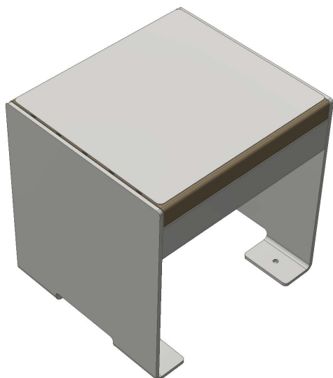
optionales Tablett (siehe Zubehör)