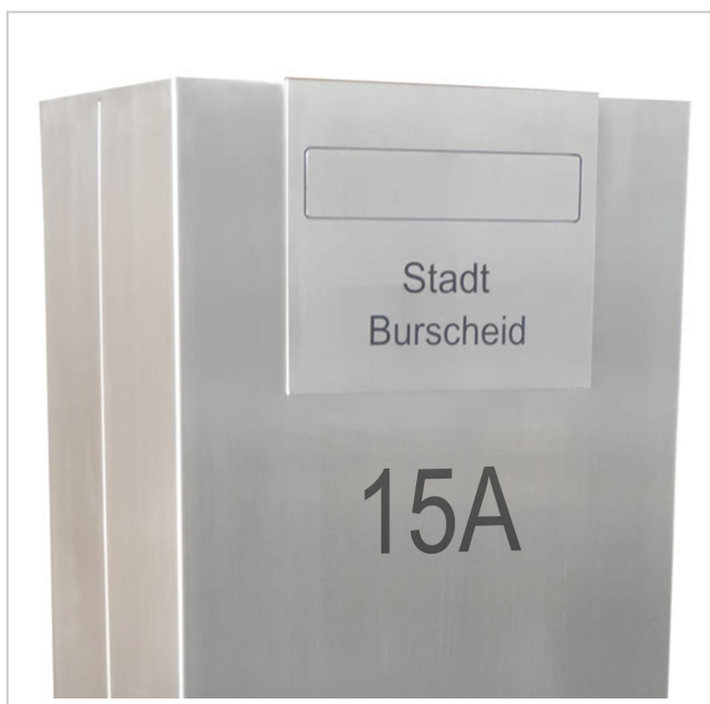
Briefkasten Manufaktur Lippe GmbH Werler Straße 60 32105 Bad Salzuflen

www.briefkasten-manufaktur.de info@briefkasten-manufaktur.de Tel.: +49 5222 807110